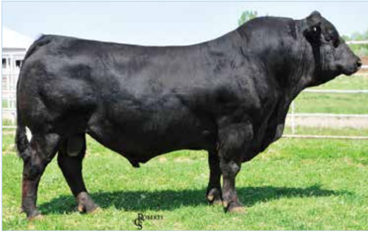
GATS XERXES • Sire of Lot 41