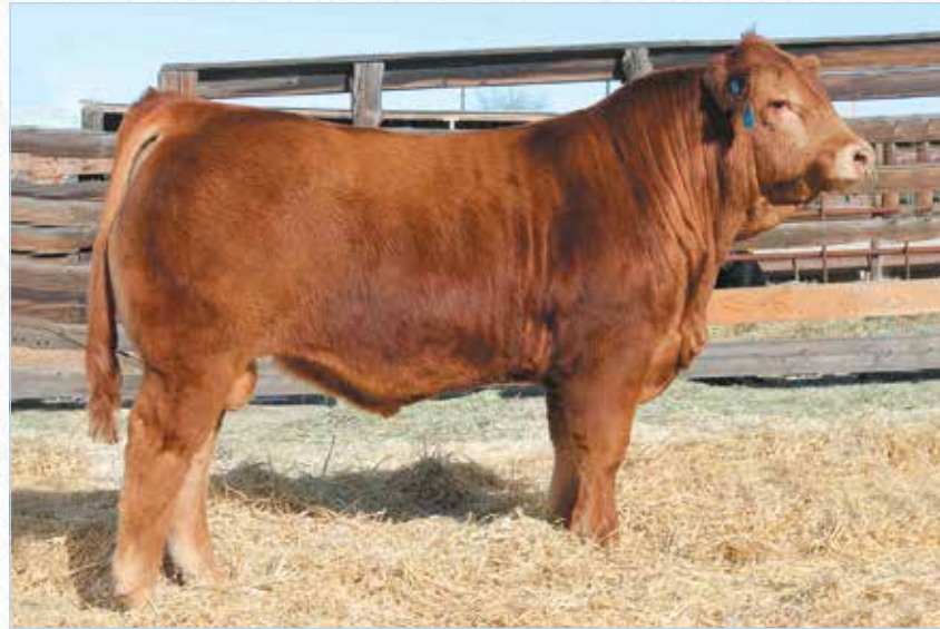
WULFS AMAZING BULL T341A • Sire of Lots 50A & 50B

PE'd 6/1/22-6/9/22 to SYES Holden 415H. Will calve 3/13/23-3/21/23. Black, Polled calf. PE'd 6/10/22-8/1/22 to TOMV Harry 031H. Will calve 3/22/23-5/13/23. Red, Polled calf.