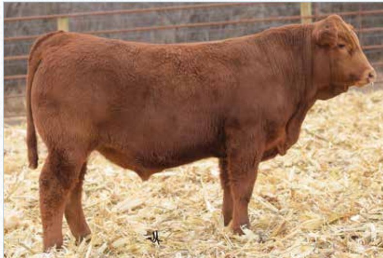
TREF ENGINEER 807E • Sire of Lots 46A, 46B & 48B

PE'd 6/1/22-6/9/22 to SYES Holden 415H. Will calve 3/13/23-3/21/23. Black, Polled calf. PE'd 6/10/22-8/1/22 to TOMV Harry 031H. Will calve 3/22/23-5/13/23. Red, Polled calf.