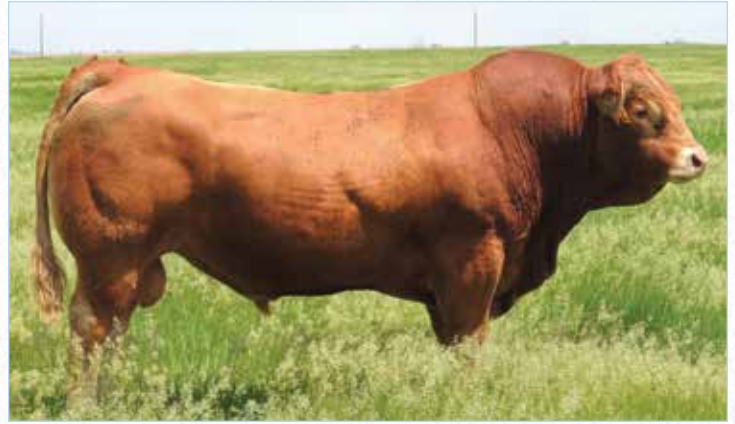
TOMV DIESEL 619D • Sire of Lot 33