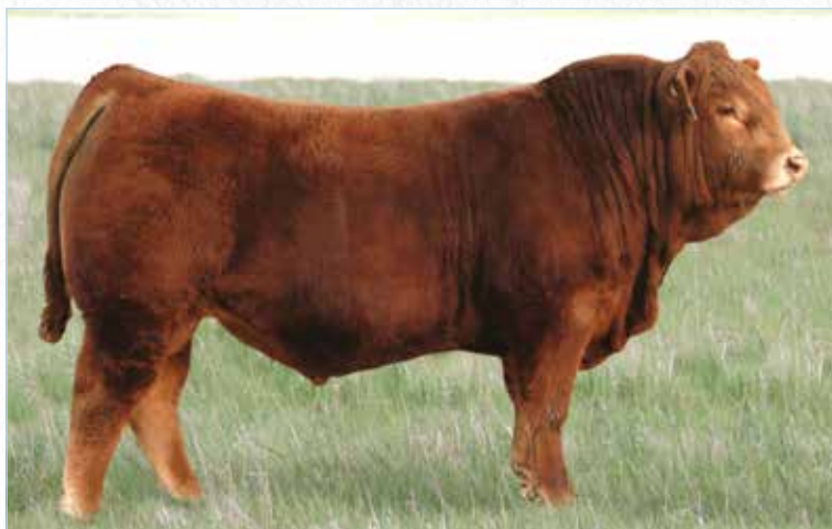
TREF HARDCORE 204H • Sire of Lot 1

This red, homozygous polled, herd sire prospect is sure to be a crowd favorite sale day. He is sired by TREF Hardcore 204H, the TOMV Diesel 619D son that sold for $50,000 at the 2021 Trefz Where Muscle Still Matters Annual Bull Sale. This sire caught the attention of many being at the top of the breed for growth, docility and ribeye. His dam is CRVL Miss Xerox 307A, a nine-year-old DLVL Xerox 023X daughter that is in the top 1% of the breed for docility. Visually, he is heavily structured and level-topped with extra muscle expression. He moves freely off both ends of his skeleton. On paper, CRVL Kit Kat 233K has impressive stats—a 78 weaning weight EPD, a 122 yearling weight EPD and a 19 EPD for docility. Make no mistake and be sure to have him on the top of your list.