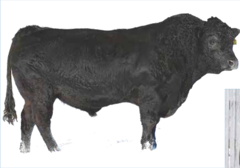
RUNL STETSON 850S • Paternal grandsire of Lots 10, 11 & 12