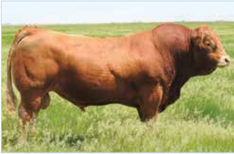
TOMV DIESEL 619D