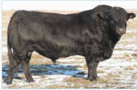
TREF GUNPOWDER 290G