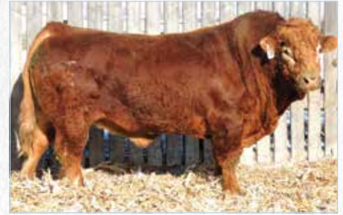
TREF EZ STREET 107E