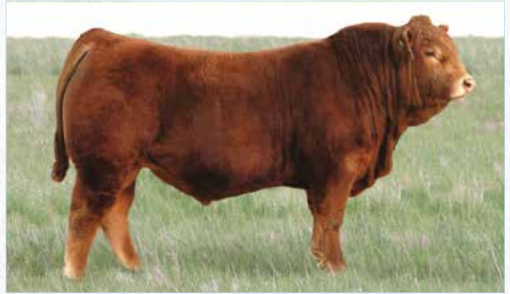
TREF HARDCORE 204H • Sire of Lot 36