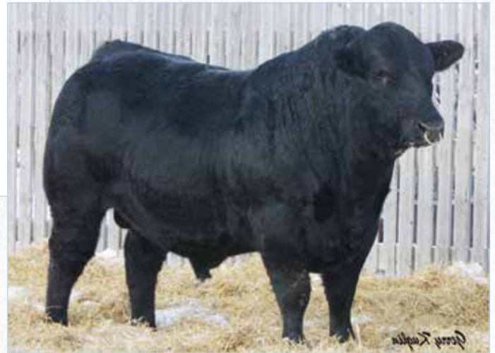
JYF ZEEK 151Z • Sire of Lot 13